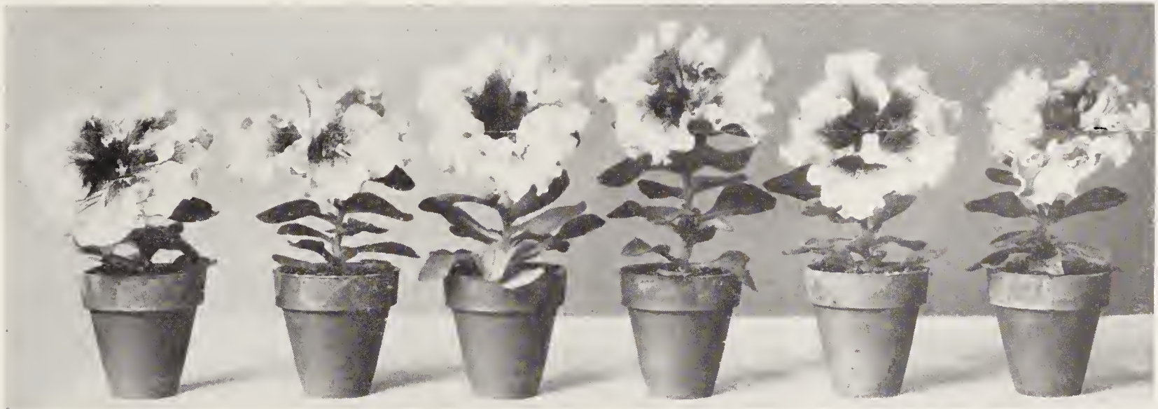
No. 1 Diener's Ruffled Monsters in 3-inch pots, 12 weeks after sowing